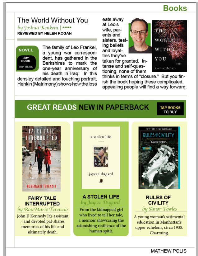
Re-Created File in Preview Mode

“What we have to learn to do, we learn by doing.”