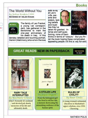
Re-Created File in Edit Mode.

Notice notes on the side in red to help use file as a future reference.